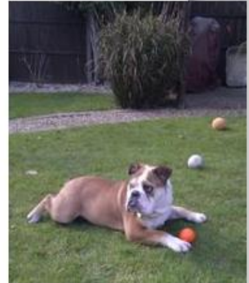
Diesel loves the beach.. and balls!