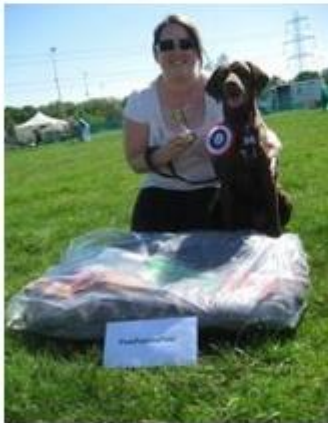
..And here's new member Honey - who won Dorset Dog of the Year at the Dorset Dogs Festival!