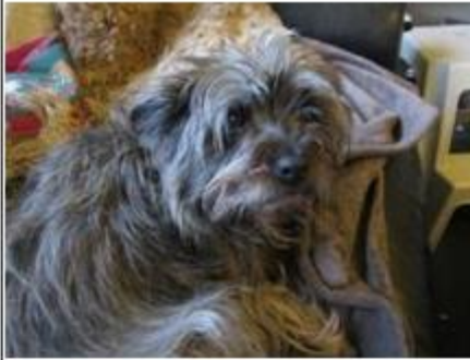
...must have just returned from another energetic trip to Kingston Lacey!