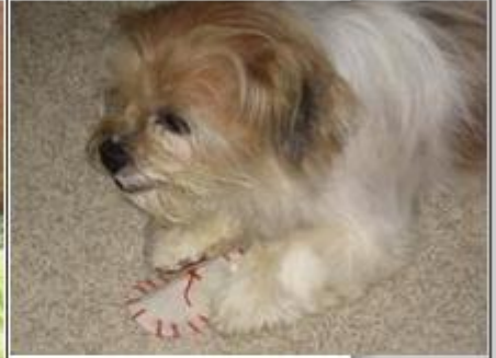
Huggy's a Lhasa apso cross who used to chase squirrels... until she found she just couldn't catch them! So she'll settle for a slipper for now...