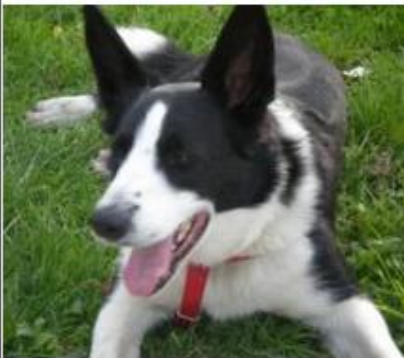
Blue just adores his beautiful forest walks