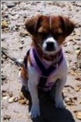
Cricket's air of petite nobility must come from his Chihuahua x king charles spaniel heritage!