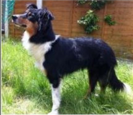
Hermione & Harry live in the Weymouth area but they love to visit lots of different places.