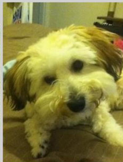
Maxwell is very social, loves other dogs and loves being outside. He'd like to find more places suitable for disabled use in West Dorset - any suggestions for 'easy access' places to walk?

Welcome also to all the new members who have joined at recent local events - PLEASE EMAIL YOUR PHOTOS TO US AT dorsetdogs@dorsetcc.gov.uk with your owner & dog name - we'd love to see your pictures...!