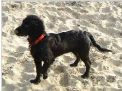
Cassie's another fan of Slade's Farm Open Space but here she is enjoying a trip to the beach...

...so that's a big hello to: Penny, Ruby & Milo, Scooby & Marble, Megs, Nessie, Rowan, Roxy & Binx, Webster & Holly, Otto, Charlie & Abby & Minnie, Summer & Taurus, Milo, Poopy & Lottie, Magic, Poffertje, Susie & Lucy, Khan & Foxy, Madds & Treacle, JJ, Berlington Bertie of Bow (Bertie visits from Shropshire and joined on behalf of himself and his 20 housemates).