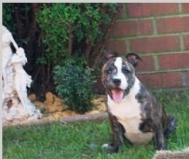
Rambo's 'dad' told us that this energetic, bouncy but gentle little puppy just wants to be everybody's friend!