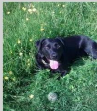
Silky Katy is beautifully behaved and excellent with children. Two of her favourite places are Delph Woods & Slades Park Open Space - we agree Katy, those are going on our site info list soon!