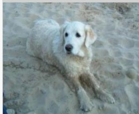
... Sophie & Cassie live together and share their seaside days with wet & sandy enjoyment before flopping down for a breather...