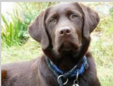
Soulful Blue is only ten months old and adores free running!